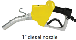
1" diesel nozzle

With Trigger Hold Open & NO PRESSURE NO FLOW SAFETY VALVE