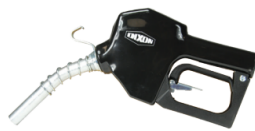
3/4" gasoline nozzle

With Trigger Hold Open & NO PRESSURE NO FLOW SAFETY VALVE