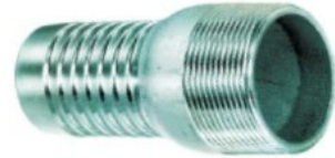
KING NIPPLE X HOSE BARB