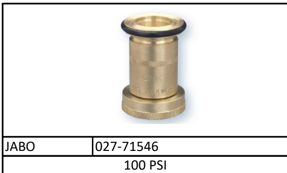
MINE GUARDIAN FOG NOZZLE NPSH/IPT