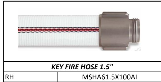
MSHA APPROVED SINGLE JACKET POLYESTER FIRE HOSE WITH NPSH ENDS