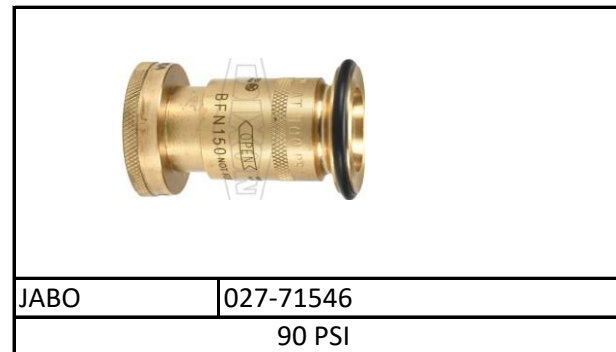
BRASS INDUSTRIAL FOG NOZZLE