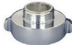
reducer - chrome plated